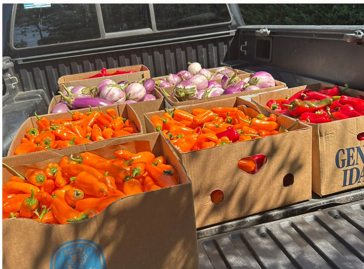
Eggplant and Peppers from Purple Mountain!