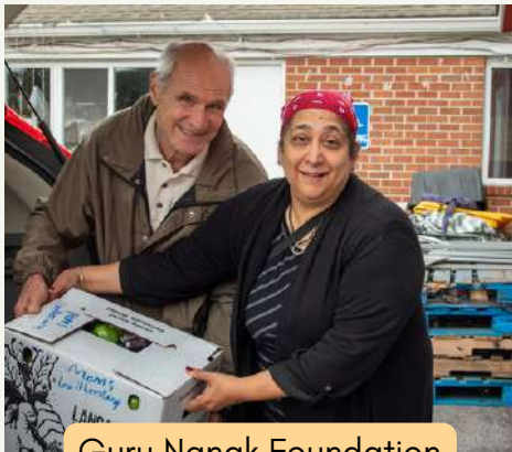
Guru Nanak Foundation

Ensuring students in Montgomery County have access to healthy food is a high priority for Manna Food Center and each week during this school year, Farm to Food Bank volunteers delivered 1,622 lbs of fresh produce and eggs to 4 elementary school-based pantries Manna operates , equivalent to 1,391 meals. Available items included apples, cauliflower, sweet potatoes, and sweet peppers.