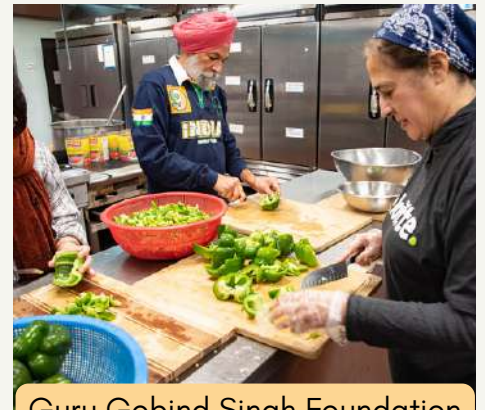
Guru Gobind Singh Foundation

Sharing local produce with the food assistance network in Montgomery County is an essential goal of the Farm to Food Bank program. Volunteer food runners deliver vegetables to Guru Nanak Foundation of America and Small Things Matter for their weekly distributions. At Guru Gobind Singh Foundation, volunteers create freshly prepared meals from farm-fresh ingredients and distribute those meals to partner food providers and directly to residents.