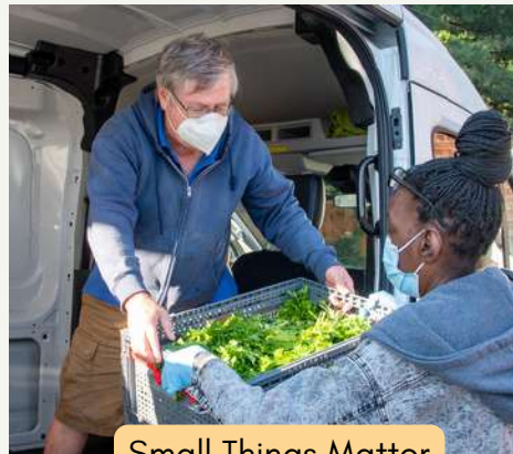
Small Things Matter