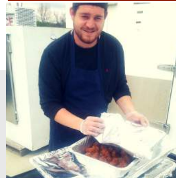
Trays of prepared food from High Point Catering donated to MCCH