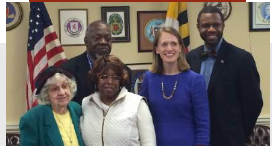
Manna client testified in Annapolis in support of Senate Bill 758, to increase the minimum senior benefits from $16 to $30/mo