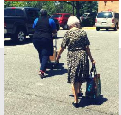
A volunteer brings 60 lbs of food to the car of a Manna client