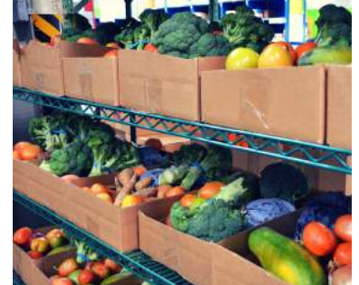
Boxes of fresh items are prepared for clients every day & often include locally grown produce