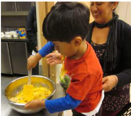
Cooking classes at local Rec Centers teach parents creative ways to prepare healthy, budget meals