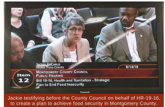
Jackie testifying before the County Council on behalf of HR-19-16, to create a plan to achieve food security in Montgomery County.

Increase in minimum SNAP benefits to seniors