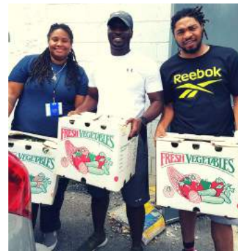
Fresh food donated by One Acre Farm & received by People Encouraging People

Total number of people served with this rescued food