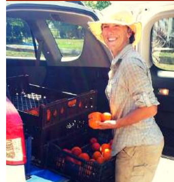
Beautiful local produce shared by Plow and Stars Farm