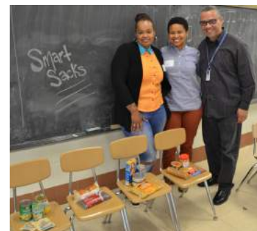
Focus groups with parents & teachers at Waters Landing Elementary (above); Partner packs bags for the week (below)